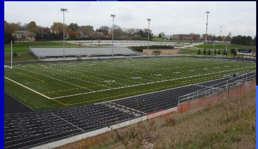
Regulation Football Field 150 ft x 300 ft = 45,000 SF